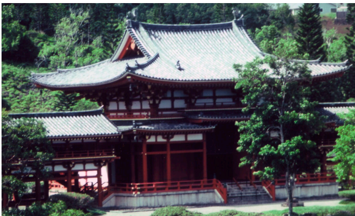
Byodo-In Temple on Oahu

Attention Authors If you have personal mailing lists, Blog or web site be sure to mention that you will be in Hawaii in March 2009.